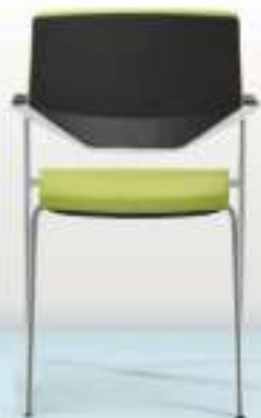
656-6204 → 4-legged chair → Chromium-plated steel/ polished aluminium

giroflex 656 – Visitor's chair: available as a cantilever made of rectangular steel tube or as a 4-legged chair. Stackable versions also available. Aluminium frame, polished and chromium-plated or powder-coated. Backrest optionally with leather or fabric cover or with black 3D knitted fabric. Armrests optionally with hand-sewn leather sleeves.