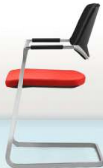
656-6002 → Backrest with 3D knitted fabric → Leather sleeves → Cantilever chair → Chromium-plated steel/ polished aluminium