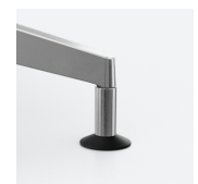
5-arm base with glides