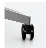
5-arm base castors 50 mm