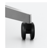
5-arm base castors 65 mm