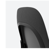
Seat- and backrest-support