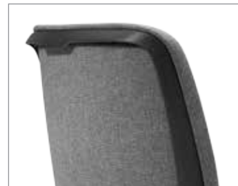
Upholstered back rest