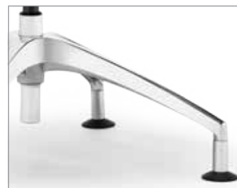
Chromium-plate metal shaft glides