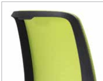
Back shell in 3D spacer fabric