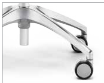
Castors, 65 mm, chromium-plated