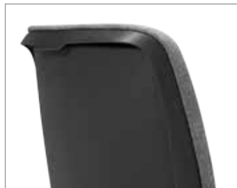
Structured back rest