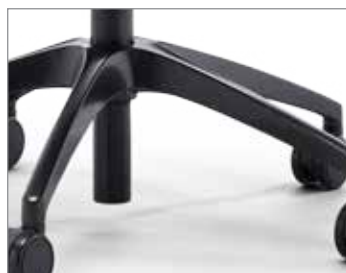
Castors, 65 mm, black